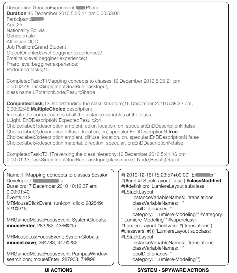
Figure 3. Biscuit output: reliable and precise data